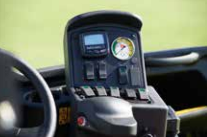
Quick Find Console® See page 6 for details.

The Toro Multi Pro WM is ready to perform when you need it most. Invite your Toro Distributor to demonstrate how this sprayer can enhance your spraying program.