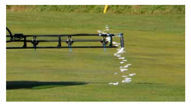
Pro Foam Marking Kit - 41232

Extends 12" (30.5cm) below the standard boom to minimize chemical drift in breezy conditions while retaining full boom system functionality.