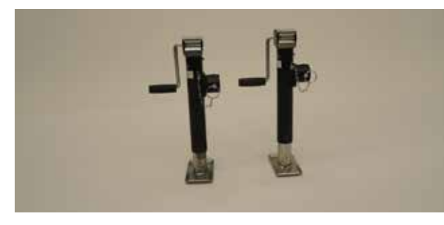
Jack Stand Kit - 41216

150' (45.7m) of hose for hand or walk spraying applications. Convenient electric powered rewind. Spray gun has an adjustable nozzle from stream to fan.