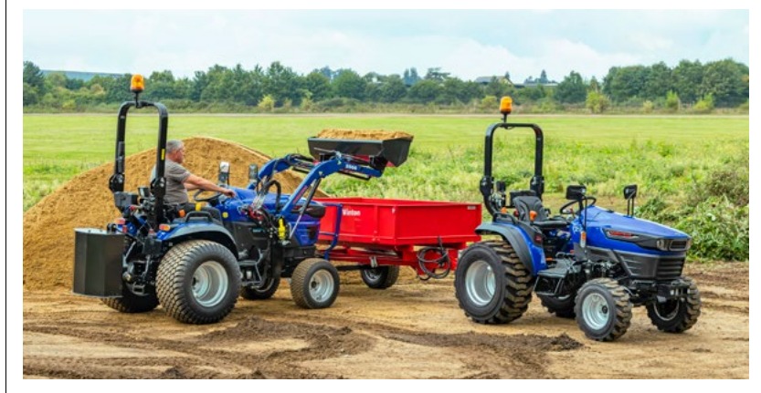
Farmtrac 25G ↑ All the functions and features of a compact tractor, with the benefits of electric power.