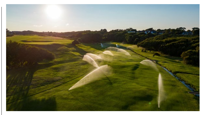
Toro Lynx Central Control ↑ Barton-on-Sea Golf Club has a new Toro Lynx Central Control System and Infinity and B Series, all of which will be at SALTEX.

in a compact and easily-manoeuvrable package is the award-winning Farmtrac FT25G electric compact tractor that has impressed the industry's electric vehicles and technology enthusiasts. Plus customer favourite FT26H with ROPS. Both are ideal for smallholders, equestrian centres and landscapers looking for quieter eco-friendlier alternatives and anyone likely to work in tight spaces, as the compact machines with narrow bodies move through everyday tasks with ease and efficiency.