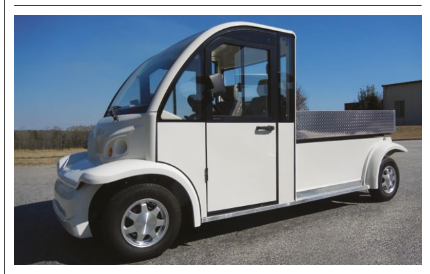
STAR AK48-2 Long ↑ The flexible carry-all with 7 HP AC Electric Drive motor and 450 amp programmable speed controller.