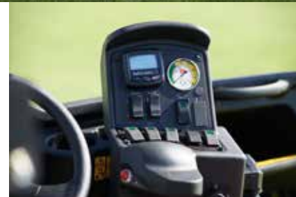
Quick Find Console®

The Toro Multi Pro WM is ready to perform when you need it most. Invite your Toro Distributor to demonstrate how this sprayer can enhance your spraying program.