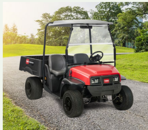
Workman MDX Lithium ↑ A crucial launch for the industry, bringing electric power to utility work.