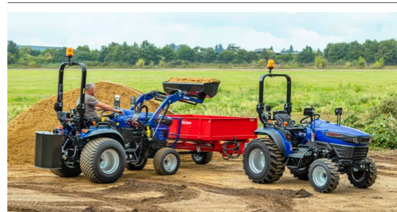
Farmtrac 25G ↑ All the functions and features of a compact tractor, with the benefits of electric power.

Providing powerful performance in a compact and easily-maneuvrable package is the award-winning Farmtrac FT25G electric compact tractor that has impressed the industry's electric vehicles and technology enthusiasts. Plus customer favourite FT26H with ROPS. Both are ideal for smallholders, equestrian centres and landscapers looking for quieter eco-friendlier alternatives and anyone likely to work in tight spaces, as the compact machines with narrow bodies move through everyday tasks with ease and efficiency.