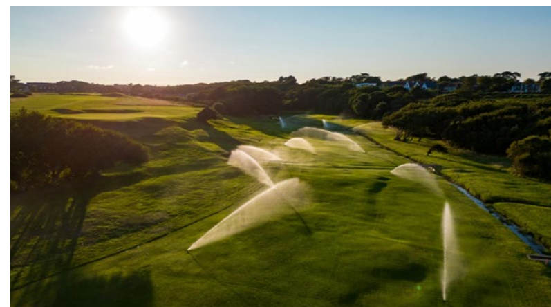
Toro Lynx Central Control ↑ Barton-on-Sea Golf Club has a new Toro Lynx Central Control System and Infinity and B Series, all of which will be at SALTEX.

From Reesink Hydro-Scapes will be a selection of irrigation and water aeration solutions from Toro Irrigation and Otterbine. See first-hand featured controllers, sprinklers and soil sensors from Toro – including Toro Lynx Central Control system, Infinity and Flex series sprinklers with Lynx Smart Module , and more. From Otterbine, its best-selling aerator for maintaining water quality in small and medium sized ponds, the Concept 3 Fractional series floating aerating fountain.