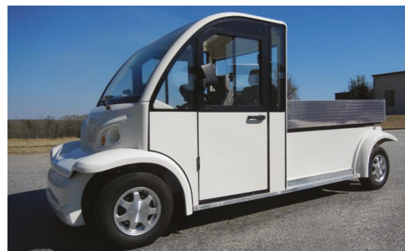
STAR AK48-2 Long ↑ The flexible carry-all with 7 HP AC Electric Drive motor and 450 amp programmable speed controller.

Reesink is back with an electric solution for transporting people and cargo around grounds, courses, stadiums and leisure venues. The STAR Capella Work Machine with caged body will appear alongside the newest addition to the line-up – the STAR AK48-2 Long with door option. This two-seat utility vehicle offers multiple cargo configurations and the next generation of customer-focused features. Also on stand is the KAASPEED scooter , configured with its shopping tray option, the new, effective and fun method of transport for guests and visitors.