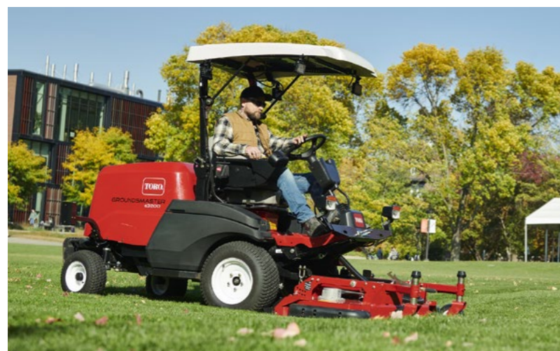
Groundmaster e3200 ← The Groundmaster e3200 in action here and on the front cover.